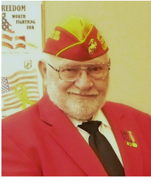
Senior Vice Commandant