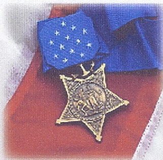
MEDAL OF HONOR